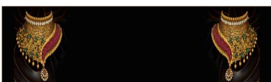
imitation jewellery at US$ 220.97 million