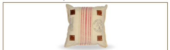
embroidered & crocheted goods at US$ 578.26 million