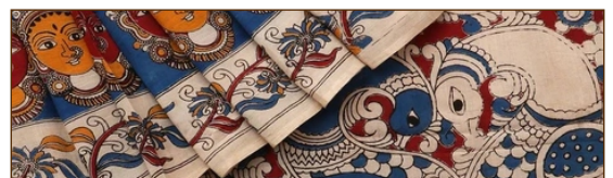
handprinted textiles and scarves at US$ 336.49 million