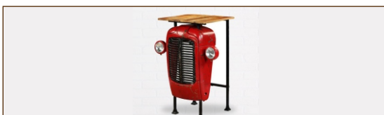
miscellaneous handicrafts at US$ 1,003.57 million